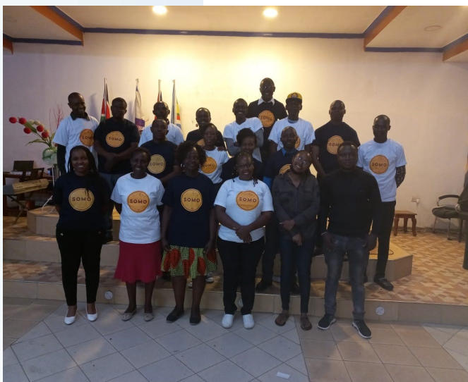
The first graduates of the SOMO Business Training classes!

“Come and listen, all you who fear God, and I will tell you what he did for me.” Ps. 66:16 NLT